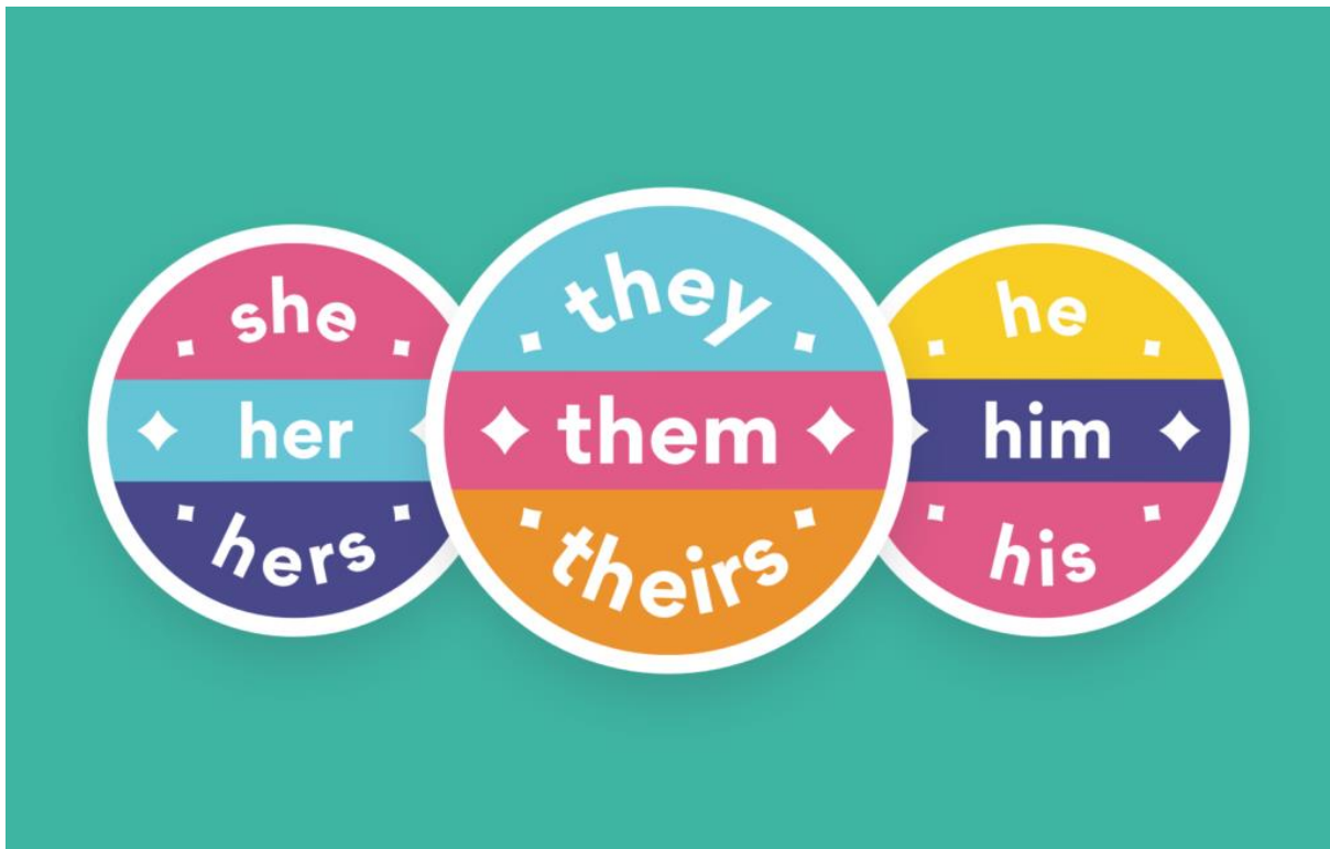
Example of gender pronouns from Asana

One way to model inclusive behavior is to include your preferred pronouns in email signatures, org charts, and slack names, such as "Candice Mitchell, she/her," or "Jameson Alex, he/they/them."